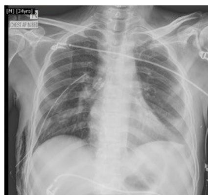
Fig 3: Chest radiograph showing complete re-expansion of the right lung and partial improvement in lingular consolidation with antibiotics and ivermectin by seven days

staining; fungal smears, BALF galactomannan and pan-fungal DNA polymerase chain reaction (PCR) were also negative. BALF wet mount unexpectedly showed rhabditiform larva consistent with strongyloidiasis (Figure 2). A diagnosis of breakthrough Strongyloidiasis and drug-resistant Klebsiella pneumoniae was made.