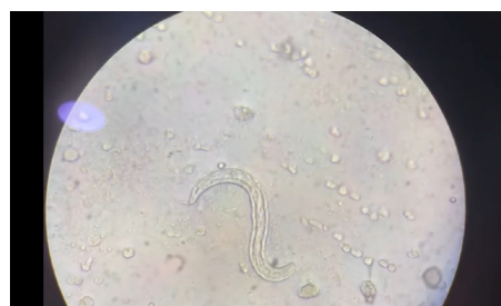
Fig 2: Wet mount of the bronchoalveolar lavage fluid showing rhabditiform larva that were motile, consistent with strongyloidiasis